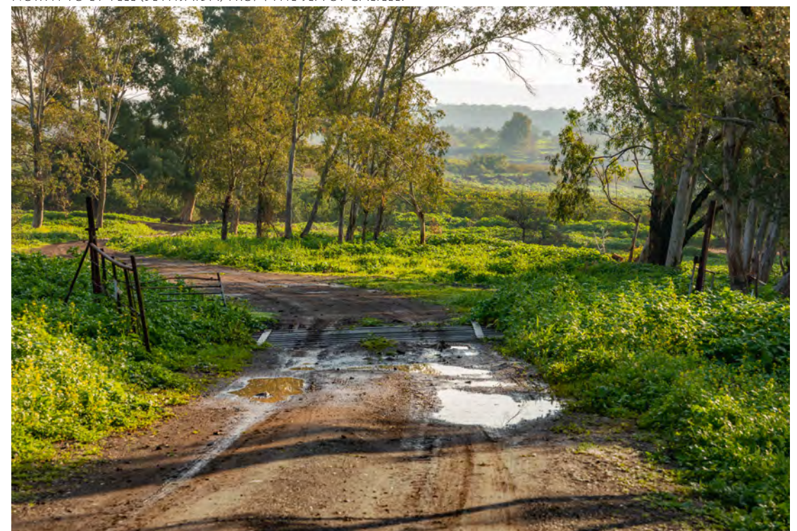
BELOW (VIEW EAST): THE PLAIN OF BETHSAIDA. THIS PHOTO WAS TAKEN BETWEEN EL-ARAJ AND ET-TELL, WALKING NORTH TO ET-TELL (BETHSAIDA) FROM THE SEA OF GALILEE.

The story above might remind you of the man who brought his son to Jesus after His disciples failed in their attempt to heal the boy. The father pleaded with Jesus, "Have compassion on us, and help us." Jesus said to the man, "If thou canst believe, all things are possible to him that believeth. And straightway the father of the child cried out, and said with tears , Lord, I believe; help thou mine unbelief " (Mark 9:17–24, emphasis added). Recognizing weakness but turning to Jesus for help with an increase in faith will achieve what belief cannot do on its own.