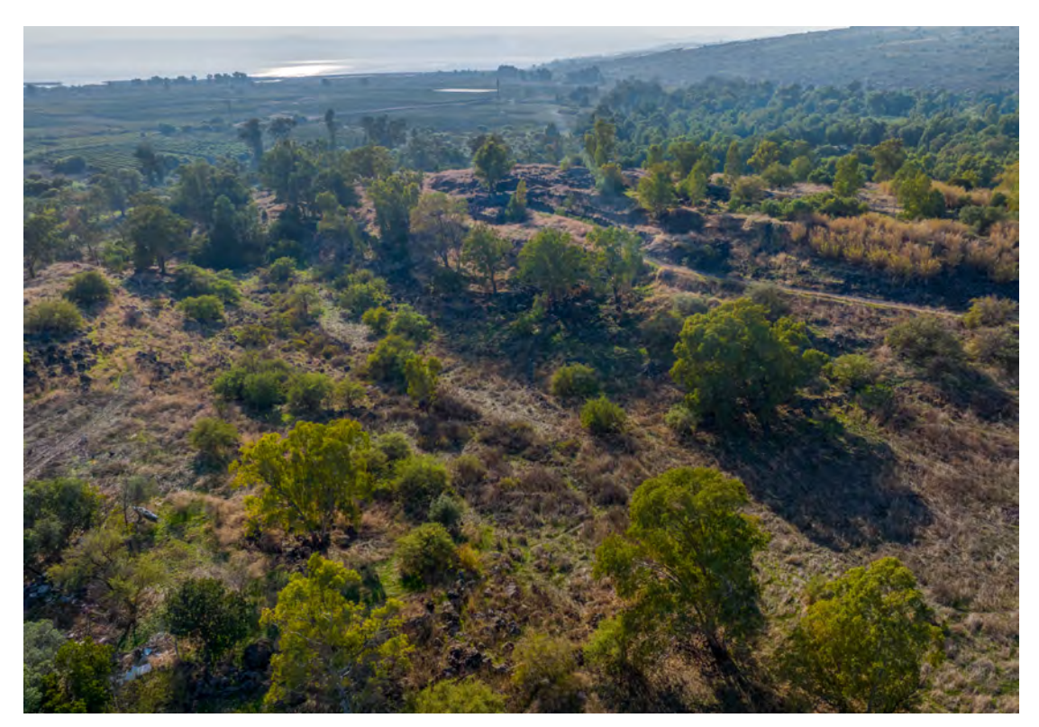
VIEW SOUTHWEST: THE GATE OF BETHSAIDA (ET-TELL; TOP CENTER BELOW THE SUN STREAK). THE PHOTO SHOWS THE CITY IN RELATION TO THE PLAIN AND THE SEA OF GALILEE (TOP). THE JORDAN PARK IS IN THE TREES (TOP RIGHT).