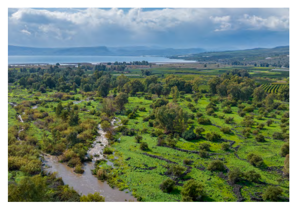
VIEW WEST: THE PLAIN OF BETHSAIDA WITH THE FISHING VILLAGE OF EL-ARAJ ON THE NORTHEAST SHORE OF THE SEA OF GALILEE (TOP CENTER IN THE TREES BY THE SHORE). ABOVE THE TREES ACROSS THE LAKE ARE TIBERIAS AND MT. ARBEL.

BELOW (VIEW NORTHWEST): THE EXCAVATIONS OF THE OTHER BETHSAIDA (EL-ARAJ) ON THE NORTHEAST SHORE OF THE SEA OF GALILEE.