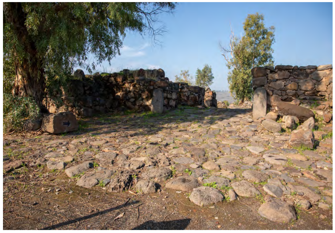
256 - BLESSED PILGRIMAGE · THE WAY OF CHRIST THE LORD

BELOW (VIEW WEST): LOOKING IN THE INNER CITY GATE (ABOVE) ACROSS THE COURTYARD, WHICH WAS THE HEART OF THE ANCIENT TOWN.