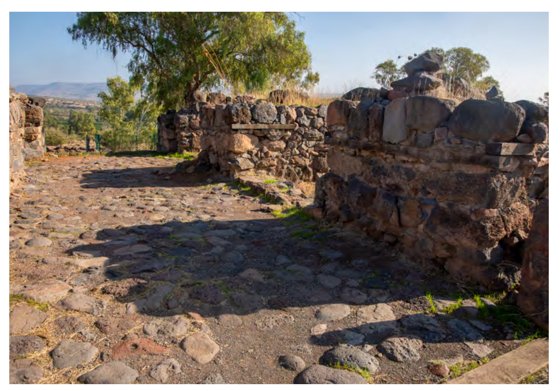
VIEW NORTHEAST: LOOKING OUT BETHSAIDA'S INNER-CITY GATE WITH FOUR CHAMBERS, TWO ON EACH SIDE. THREE OF THE CHAMBERS SERVED AS GRANARIES. THE ASSYRIAN KING TIGLATH-PILESER III DESTROYED THE CITY IN 732 BC.

BELOW (VIEW WEST): LOOKING IN THE INNER CITY GATE (ABOVE) ACROSS THE COURTYARD, WHICH WAS THE HEART OF THE ANCIENT TOWN.