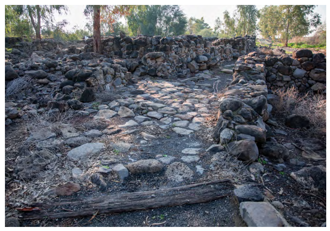
VIEW SOUTH: THIS WAS A STREET IN BETHSAIDA, REMINDING US THAT "WHITHERSOEVER [JESUS] ENTERED, INTO VILLAGES, OR CITIES, OR COUNTRY, THEY LAID THE SICK IN THE STREETS" TO BE MADE WHOLE (MARK 6:56).

Jesus fed five thousand men, besides women and children, near Bethsaida (Luke 9:10; see "Plains of Bethsaida and Gennesaret" on page 203). He also healed a blind man in Bethsaida (Mark 8:22). The blind man's story is interesting. First, the manner of the miracle was different in that it required two steps to complete. And second, the man's house is mentioned as being in a different location from the town: