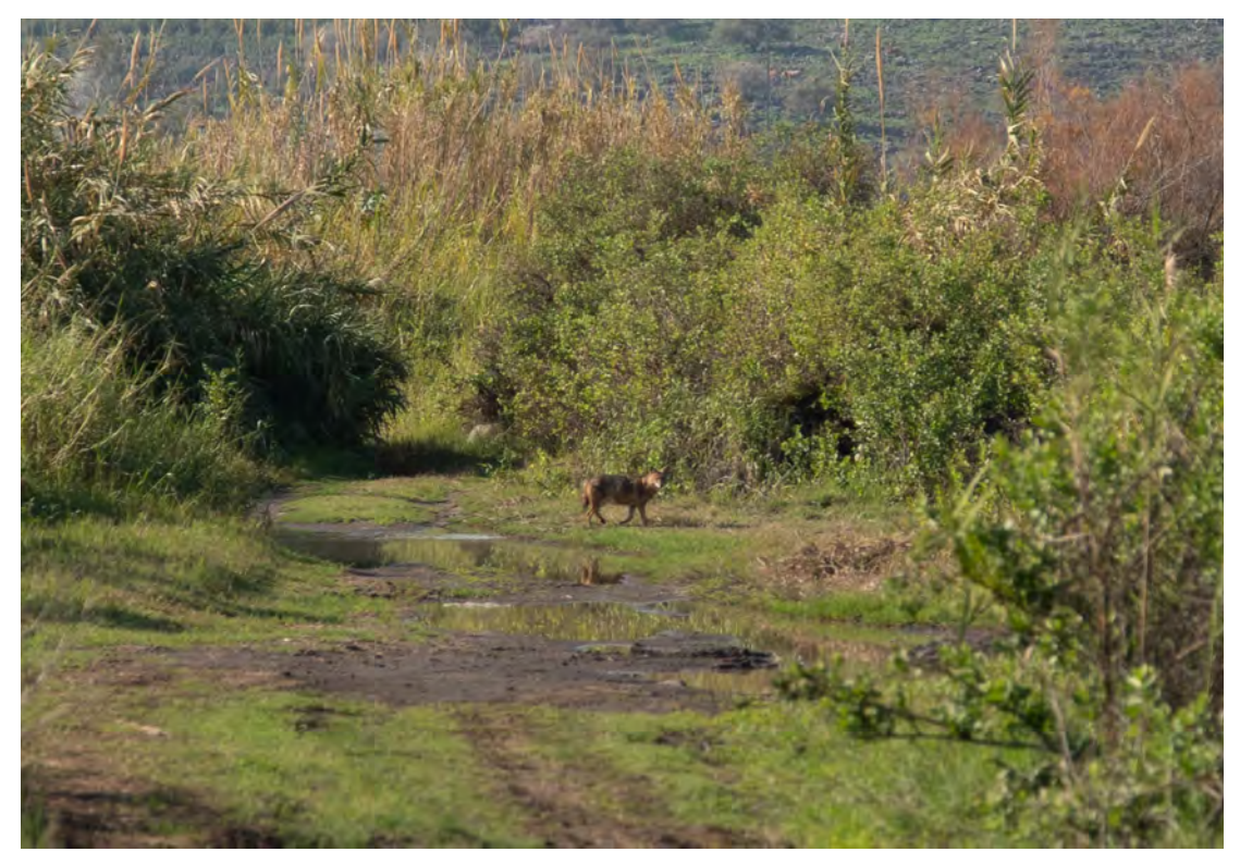
VIEW WEST: THIS PHOTO WAS TAKEN ON THE PLAIN OF BETHSAIDA A SHORT DISTANCE WEST OF EL-ARAJ (BETHSAIDA) ON A HIKE TO CAPERNAUM, I GOT LUCKY AND CAUGHT THIS PICTURE OF A RED FOX CROSSING THE PATH.