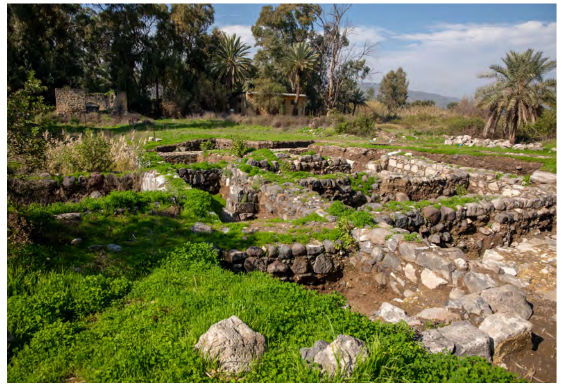
262 - BLESSED PILGRIMAGE · THE WAY OF CHRIST THE LORD

BELOW (VIEW NORTHWEST): THE EXCAVATIONS OF THE OTHER BETHSAIDA (EL-ARAJ) ON THE NORTHEAST SHORE OF THE SEA OF GALILEE.